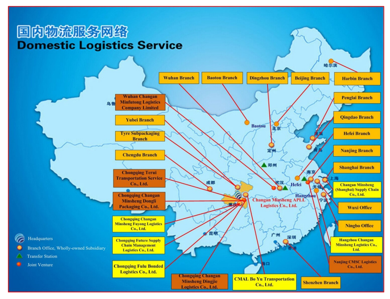
Chart 2: Location of the Company's existing branches, subsidiaries and representative offices

As at 31 December 2014, the Company had a total of 27 branches, subsidiaries, associated companies and representative offices, which are mainly located in East China, Central China, North China, South China, Northeast China and Southwest China (Chart 2). The continuous enhancement of service network enables the Group to provide logistics services to different parts of the country.